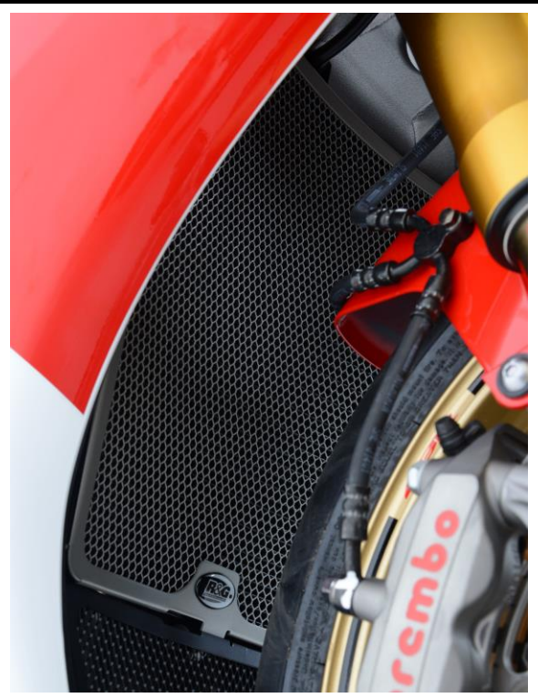
In This Kit There Should Be 1x Radiator Guard (RAD0065) 2x Cable Ties 2x 100mm Lengths of self-adhesive Foam